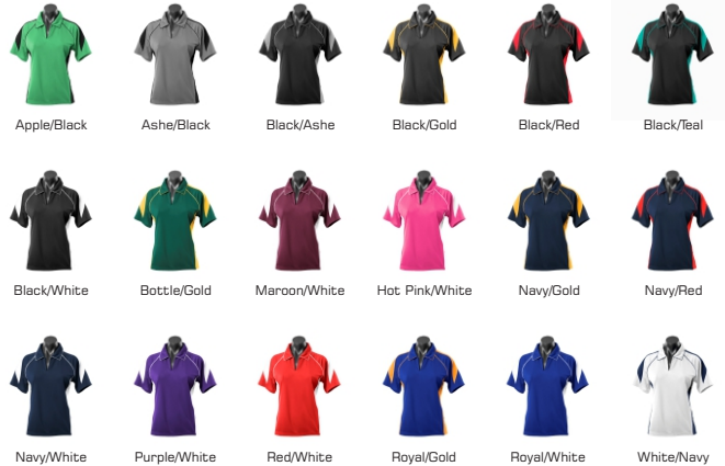
Apple/Black Ashe/Black Black/Ashe Black/Gold Black/Red Black/Teal Black/White Bottle/Gold Maroon/White Hot Pink/White Navy/Gold Navy/Red Navy/White Purple/White Red/White Royal/Gold Royal/White White/Navy

Also Available in matching Men's and Kids styles.